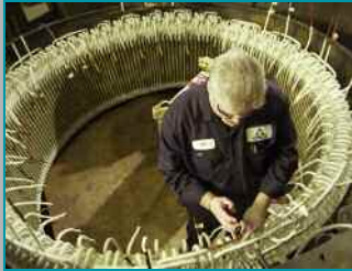
EnduraSeal® VPI Rewind