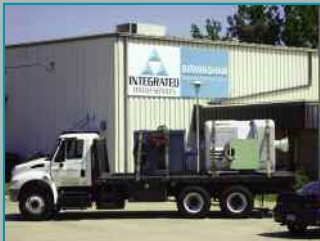
Dedicated trucks and 20 ton cranes