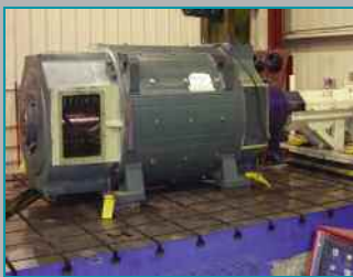
Load testing to 1,750 HP and 7,200 VAC / 750 VDC