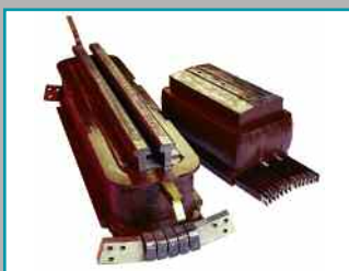
Remanufactured field coils - edge and wire wound