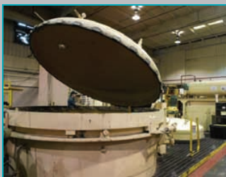
10' VPI tank