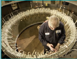
EnduraSeal® VPI Rewind