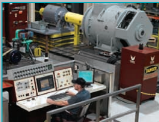
Load testing to 1,250 HP and 6,900 VAC / 750 VDC