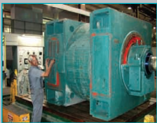
Run testing to 4,160 VAC / 700 VDC