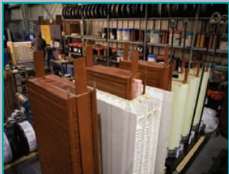
Transformer and Reactor repair