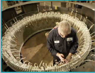
EnduraSeal® VPI Rewind