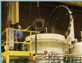
6' VPI tank