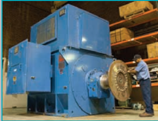
50-ton lifting capacity