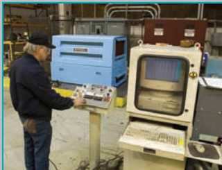
Load testing to 1,500 HP and 13.2 kV / 500 VDC