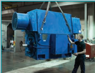
Wind generator repair up to 3+MW