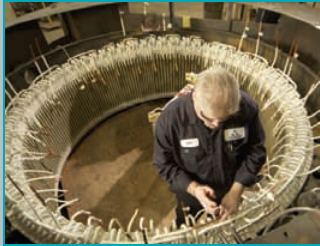
EnduraSeal® VPI rewind