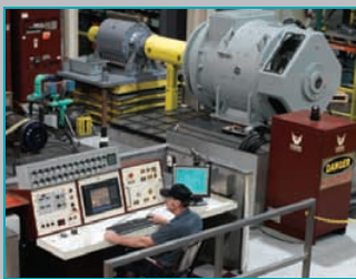
Load testing to 1,500 HP and 7,200 VAC / 700 VDC