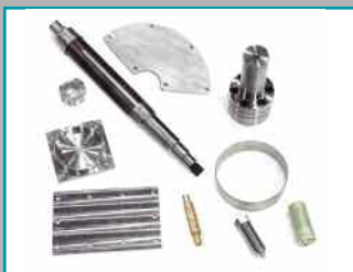
CNC precision parts

IPS Electro-Mec 4470 Lucerne Road P.O. Box 159 Indiana, PA 15701