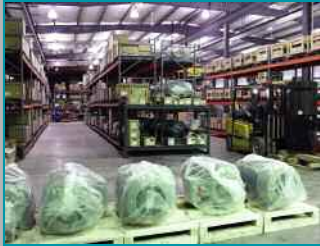
NEMA and Above NEMA inventory