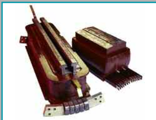
Remanufactured field coils - edge and wire wound