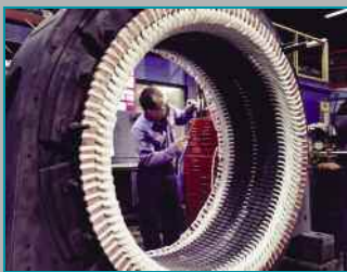
AC motor repair up to 10,000 HP