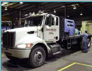
24-hour truck service

IPS Electro-Mec 4470 Lucerne Road P.O. Box 159 Indiana, PA 15701