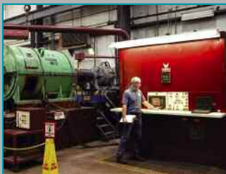
Load testing to 1,500 HP and 13,800 VAC / 750 VDC