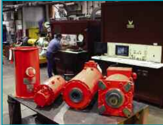
Mining motor exchange and repair