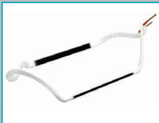
Spare stator coils up to 15 kV