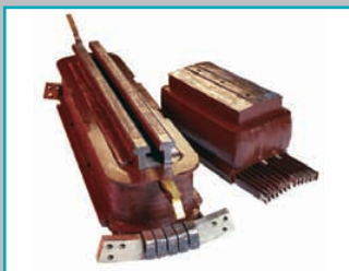
Remanufactured field coils - edge and wire wound

IPS Houston 1500 East Main Street La Porte, TX 77571