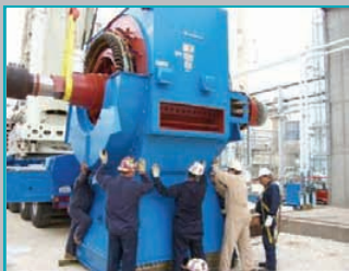
Extensive On-Site Field Services