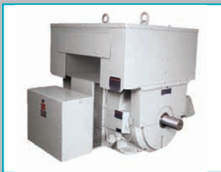
Above NEMA motors