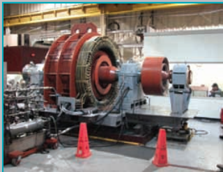
Testing up to 37,500 HP and 15 kV / 700 VDC