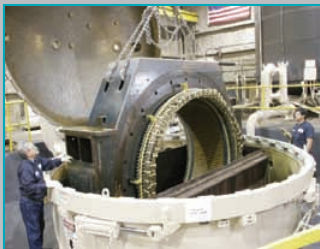
14' VPI Tank