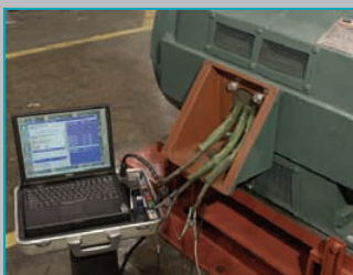
Motor Circuit Evaluation (MCE)

IPS Rock Springs 839 Elk Street Rock Springs, WY 82901