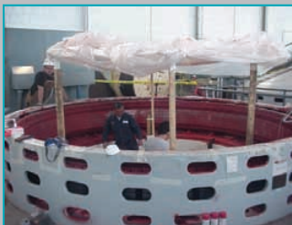
On-site hydro generator rewinds