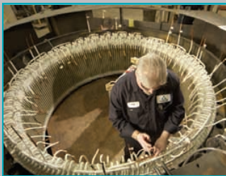
EnduraSeal® VPI rewind