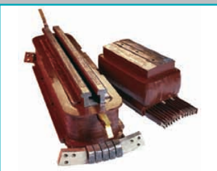
Remanufactured field coils - edge and wire wound