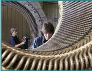
Premium VPI Rewinds: MegaSeal™ and EnduraSeal®