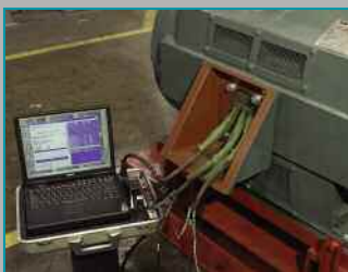
Motor Circuit Evaluation (MCE)