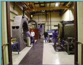
Dedicated winding clean room with 12' VPI tank