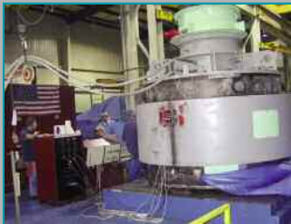
No-load testing to 25,000 HP and 13.8 kV / 750 VDC