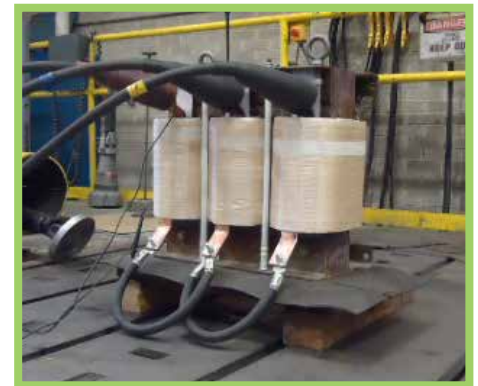
All line reactors are tested before and after remanufacture