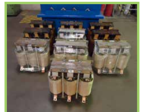
Exchange units in stock for immediate delivery