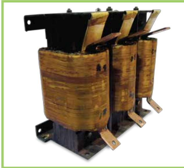
Remanufactured line reactor, including IPS upgrades ready for shipment. (Pictured: Upgraded line reactor for GE 1.5, 1.5S and 1.5SLE turbines)

IPS engineers applied their expertise in rewind technologies, insulation systems and equipment design to significantly upgrade the reliability of existing wind turbine line reactors. Our approach to remanufacturing line reactors targets problems instead of symptoms, drilling down for root cause analysis and setting the stage for definitive solutions. Our proprietary line reactor remanufacture process and design upgrades provide superior insulation dielectrics and heat transfer throughout the inductors. The resulting benefits are higher breakdown voltages, increased efficiency and extended service life.