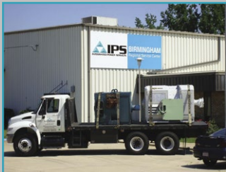
Dedicated trucks and 20 ton cranes