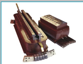
Remanufactured field coils - edge and wire wound