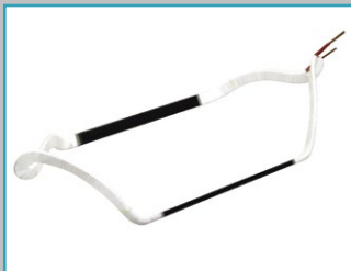
Spare stator coils up to 15 kV