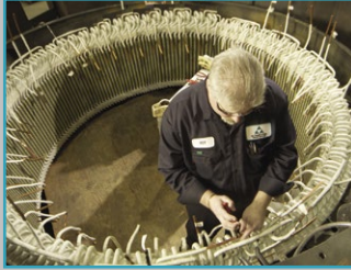
PowerSeal™ VPI Rewind