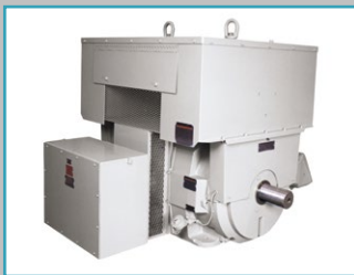
Above NEMA motors