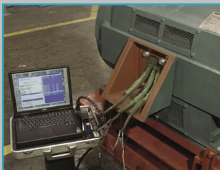
Motor Circuit Evaluation (MCE)

Birmingham Service Center 3100 Pinson Valley Parkway Birmingham, AL 35217