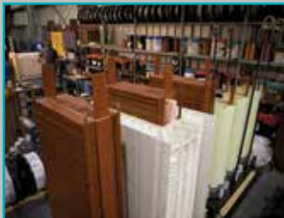
Transformer and Reactor repair