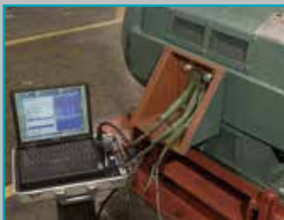
Motor Circuit Evaluation (MCE)