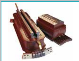
Remanufactured field coils — edge and wire wound