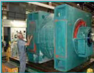
Run testing to 4,160 VAC / 700 VDC