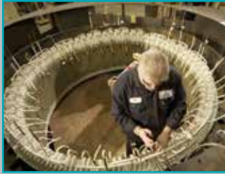
PowerSeal™ VPI Rewind