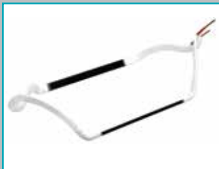
Spare stator coils up to 15 kV