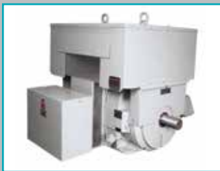
Above NEMA motors