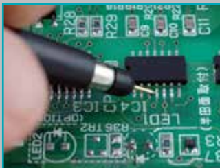
In-house industrial electronic repair