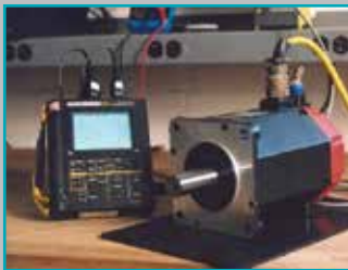
In-house servo motor repair