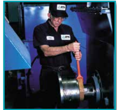
We rotate shafts on a monthly basis (or to customer specification)

MegaSeal™, our premium VPI high-voltage engineered insulation system, and PowerSeal™, our premium VPI medium-voltage engineered insulation system, both feature a five-year warranty. Our warranty begins when your motor ships from storage, no matter how many years we store it for you.