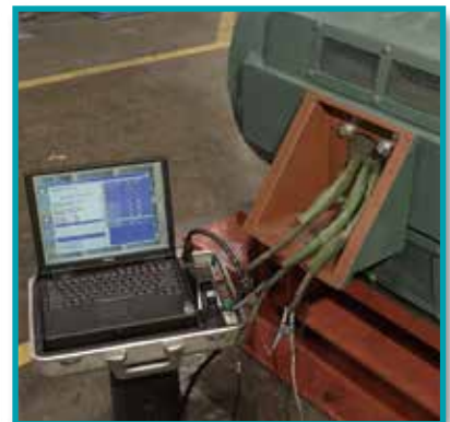
Motor Circuit Evaluation (MCE) available