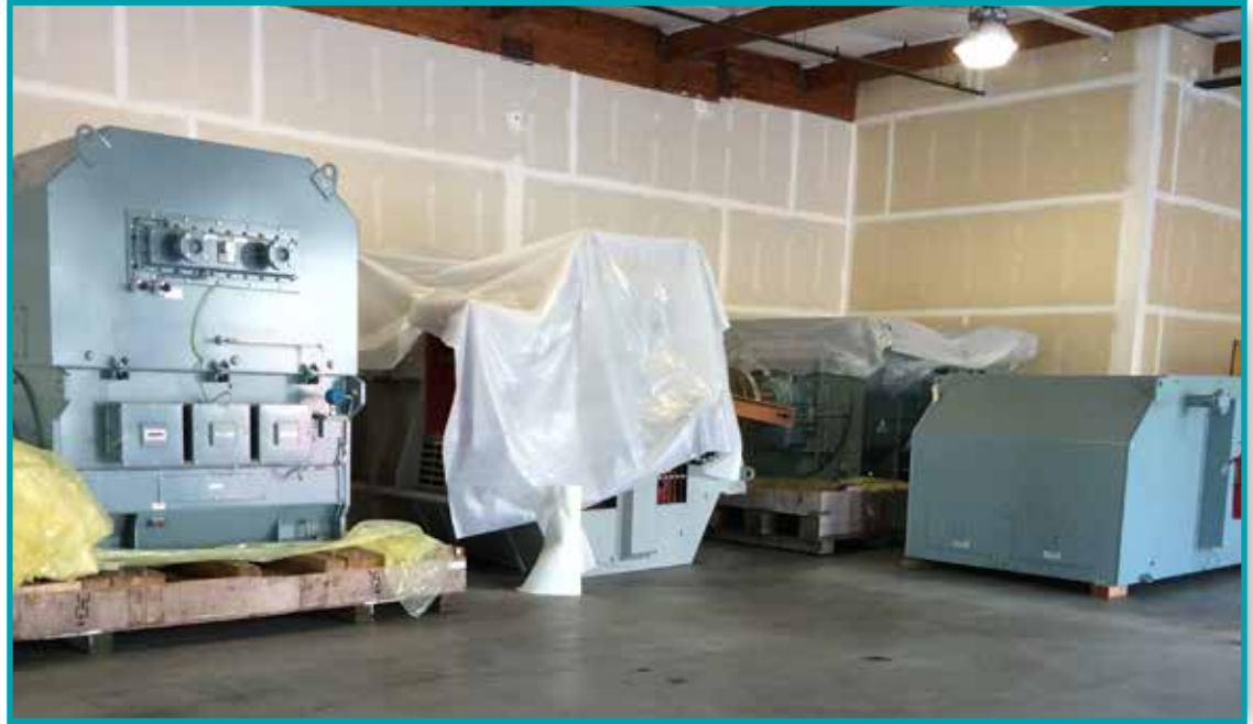
The IPS Portland Service Center has extensive experience in the professional storage and management of process critical, small, large and extra-large motors and generators