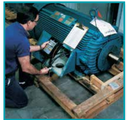
Coils are Meggered quarterly (or to customer specification)