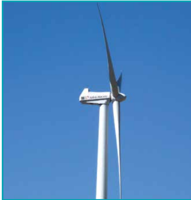
Our dedicated up-tower and in-shop technicians service NEG Micon turbines coast to coast

Chicago, IL 800.978.4559 Denver, CO 800.448.0899 Indiana, PA 800.537.0097 Litchfield, MN 888.694.6200 Portland, OR 800.366.4951 Shreveport, LA 800.366.6030 Winnipeg, MB 204.237.6066