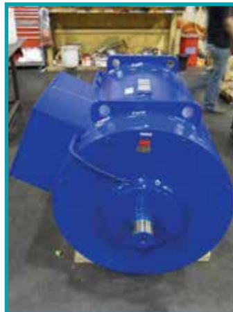
750 kW generator being repaired

We also provide comprehensive in-shop repair services and a generator unit exchange program to minimize downtime and crane costs. No matter which IPS regional service center works on your NEG Micon wind turbines, you can count on one standard of excellence for safety, quality and repairs—coast to coast.