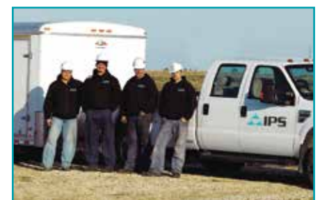
Fully-equipped field service teams