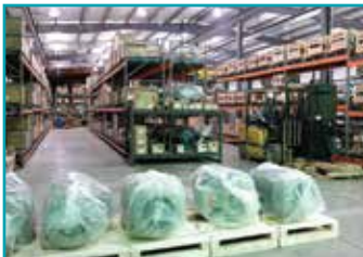
NEMA and Above NEMA inventory