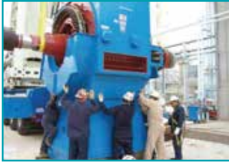
Extensive on-site field services

For Severe Weather and Other Catastrophic Events