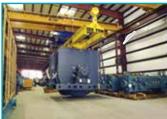
Critical equipment storage