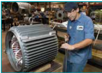
In-shop motor and generator repair