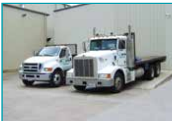
Company-owned truck fleet for fast response and delivery