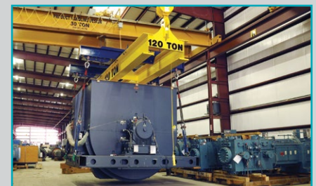
60,000 sq. ft. warehouse with relative humidity of 50% or lower