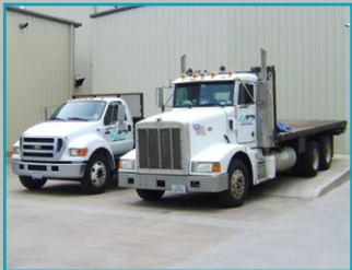
Company-owned truck fleet