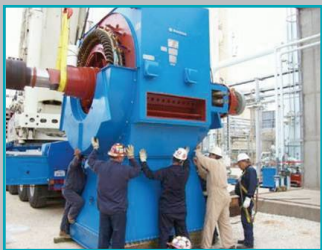
Extensive On-Site Field Services