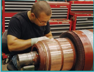
AC & DC Motor Repair