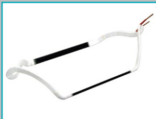
Spare stator coils up to 15 kV