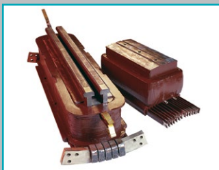
Remanufactured field coils — edge and wire wound