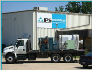
Dedicated trucks and 20 ton cranes