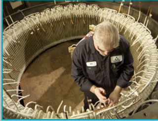
PowerSeal™ VPI Rewind