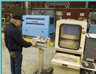
Load testing to 1,500 HP and 13.2 kV / 500 VDC