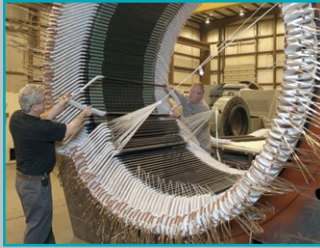
IntegraCoil™ 15 kV stator rewind