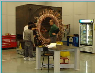
Dedicated winding clean room