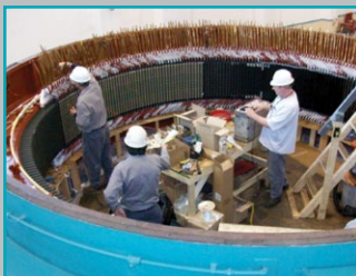
On-site hydro generator rewind