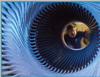
IntegraCoil™ B-stage coil rewind