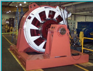
Run testing to 7,200 VAC / 700 VDC