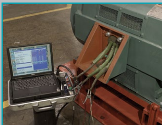
Motor Circuit Evaluation (MCE)