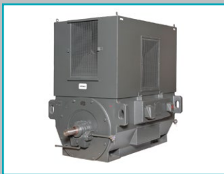
Above NEMA motors