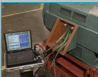
Motor Circuit Evaluation (MCE)