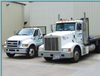
Pick-up and delivery service