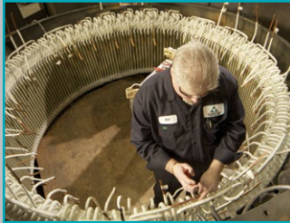
PowerSeal™ VPI Rewind