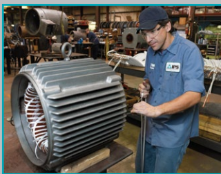
NEMA and Above NEMA electric motor repair