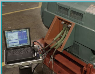
Motor Circuit Evaluation (MCE)