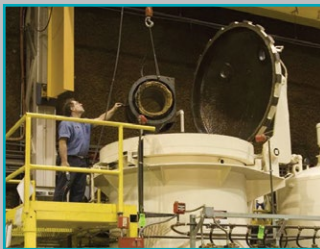
6' VPI tank