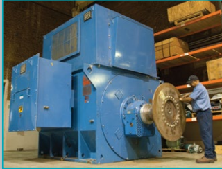
50-ton lifting capacity