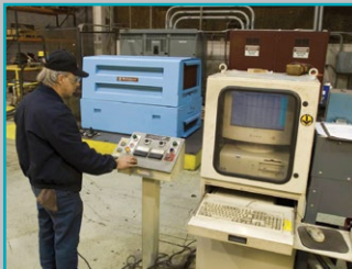
Load testing to 1,500 HP and 13.2 kV / 500 VDC