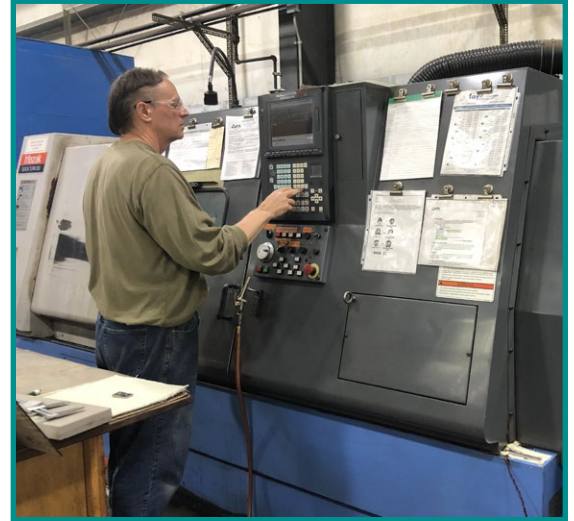
Mazak QT350 Lathe