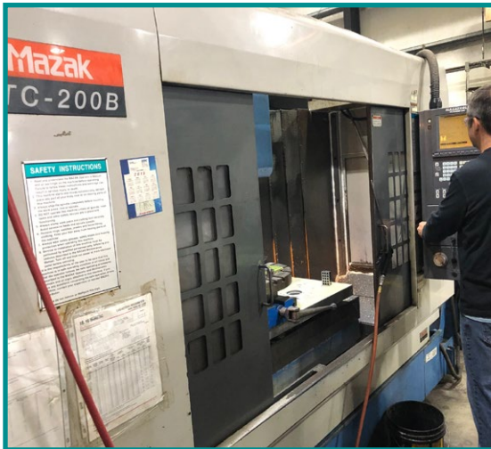
Mazak VTC200B Vertical Mill