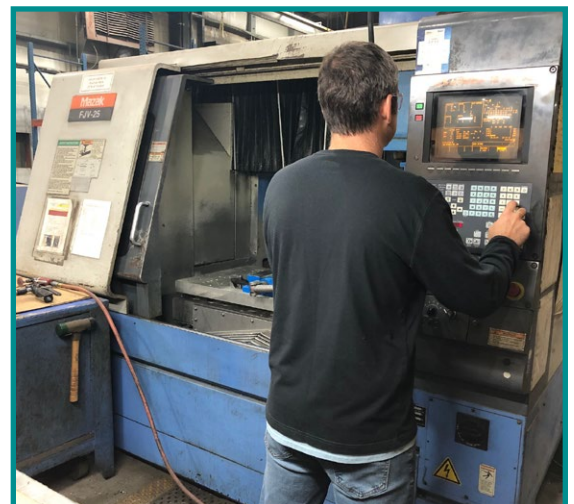
Mazak FJV-25 Vertical Mill