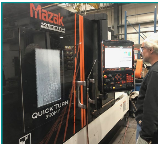
Mazak QT350MY Lathe