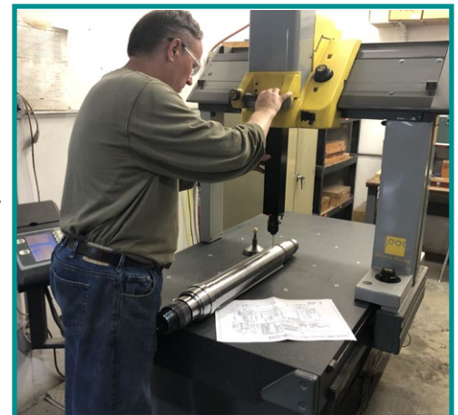
Brown & Sharpe Coordinate Measuring Machine (CMM) ensures quality, precision machined parts.

Our CNC facility has dedicated stock of high volume parts for our customers. When you buy CNC parts from IPS, you are buying the IPS system of control over quality and quantity. Our specialized CNC team is focused on customer service, and can deliver short lead times, planned production runs, and take on the complicated parts when your reputation is on the line. IPS is the unmatched leader in CNC parts for electric motors and other critical pieces of equipment. Contact us today!