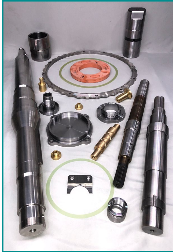
CNC machined parts include, but are not limited to the following: bearing sleeves, shafts, stub shafts, fans, insulators, cable clamps, slip rings, brush holders, stainless screws...