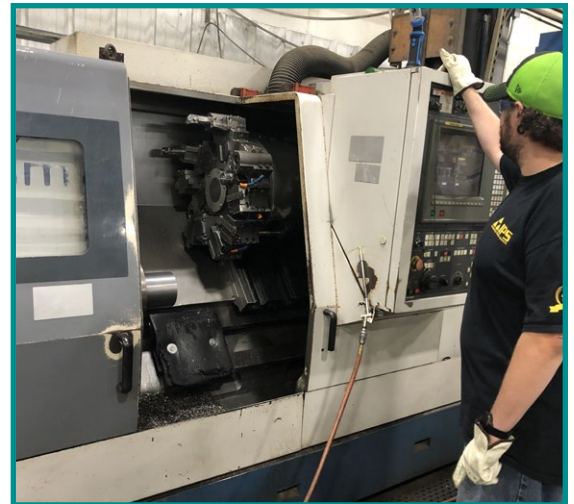
Mori-Seiki SL25M Lathe