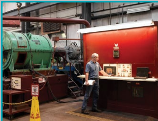
Load testing to 1,500 HP and 13,800 VAC / 750 VDC