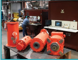
Mining motor exchange and repair