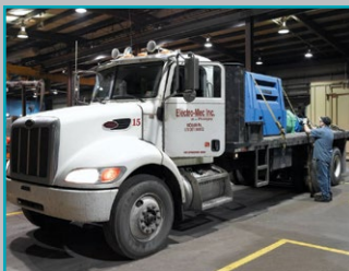
24-hour truck service