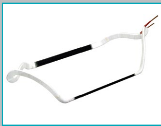
Spare stator coils up to 15 kV