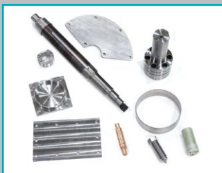
CNC precision parts