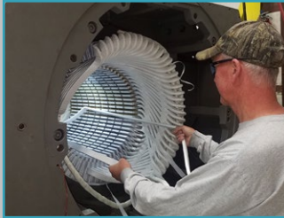
AC motor rewind up to 5,000 HP