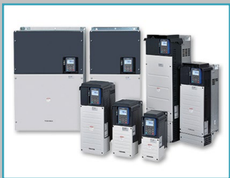
VFD inventory up to 450 HP