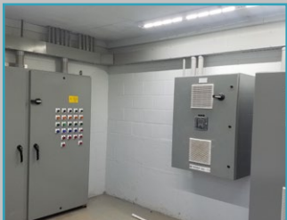
Custom control and VFD panels