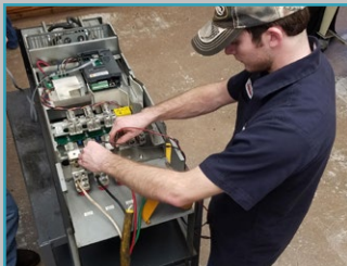
Variable frequency drive repair