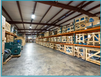
Large motor and gearbox inventory