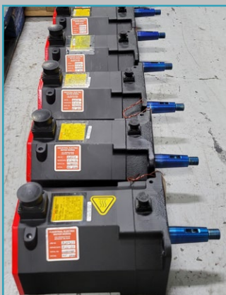
Servo motor repair