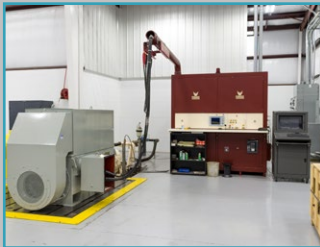
Load testing to 1,000 HP and 4,160 VAC / 750 VDC