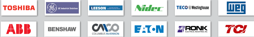
NEMA and Above NEMA motors