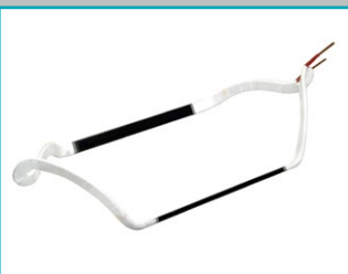
Hydro Generator Stator Coils