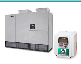
Variable Frequency Drives (VFD)