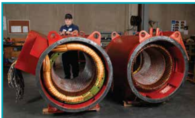
Two Elin 1.65 MW stators after rewind

We also provide comprehensive in-shop repair services and a generator unit exchange program to minimize downtime and crane costs. No matter which IPS regional service center works on your Vestas wind turbines, you can count on one standard of excellence for safety, quality and repairs—coast to coast.