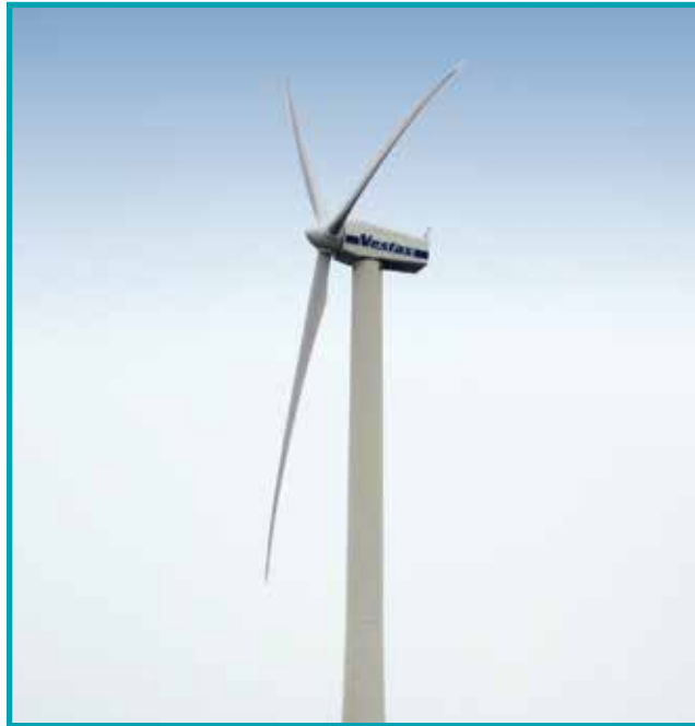
Our dedicated up-tower and in-shop technicians service Vestas turbines coast to coast

Chicago, IL 800.978.4559 Denver, CO 800.448.0899 Indiana, PA 800.537.0097 Litchfield, MN 888.694.6200 Portland, OR 800.366.4951 Shreveport, LA 800.366.6030 Winnipeg, MB 204.237.6066