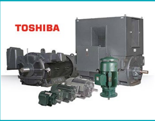
NEMA and Above NEMA motors