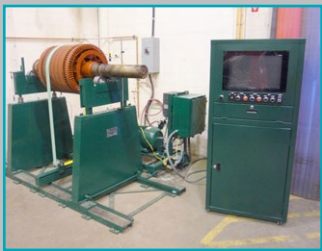
Balancing up to 22,500 lbs.