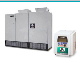
Variable Frequency Drives (VFD)