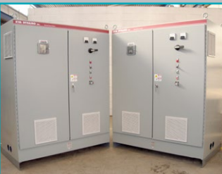
Custom Control Panels