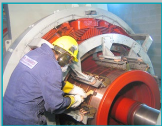
Dedicated Field Service Technicians